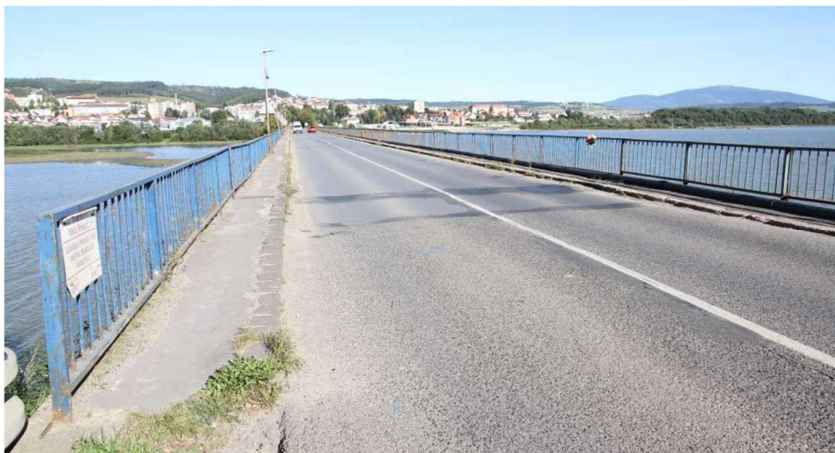
Fig. 1 Lack of traffic barriers.

The bridge structure was built in 1952. Due to the age of the bridge, a diagnostic assessment of the bridge structure was carried out in 2020, which resulted in the classification of the bridge at the sixth level of structural-technical condition, marked as 'very bad'. As of this paper (2023), the bridge is only opened for passenger traffic and freight transport up to 12 tonnes. In order to slow down the degradation of the bridge, the road owner has reduced the maximum speed limit to 60 km/h and restricted freight traffic access. Currently, the bridge's upper structure shows extensive damage and diagnostic assessments indicate that partial repairs would be ineffective and therefore the bridge requires comprehensive reconstruction. At the same time, as can be seen in Fig. 1, the bridge lacks sufficient traffic barriers, which results in many accidents.