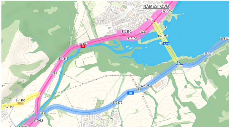
Fig. 2 Traffic intensity in 2015.

The demand analysis describes expected transportation uses for the project. Since this is a reconstruction project rather than a new segment, the input data for the traffic model is from the 2015 traffic counts. Traffic intensity is shown in Fig. 2. At the time of that count, the segment was fully utilized as it will be after reconstruction. This data was then recalculated with traffic development factors that provide a sufficient assumption of traffic development in the area.