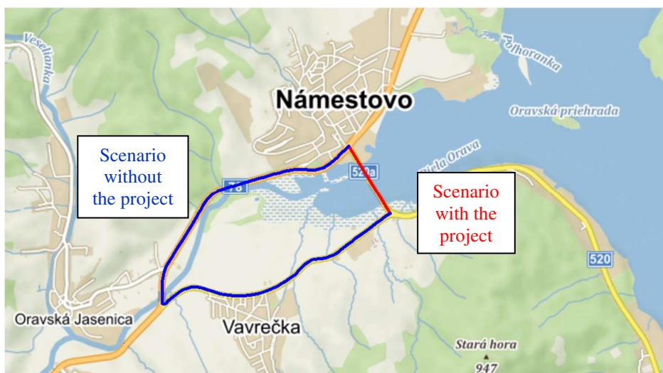
Fig. 3 Different scenarios.